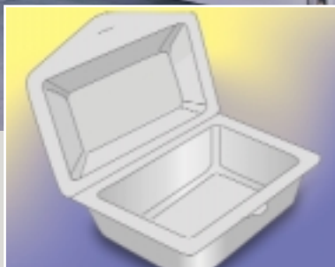
Fast food trays/clamshells