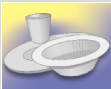
Cups and plates